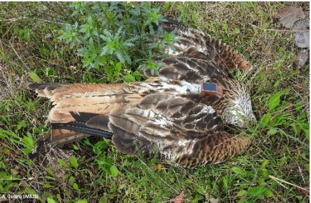
A tagged Red Kite of the LIFE EUROKITE project, which was found dead in Portugal.

Wildlife poisoning in Italy. Data analysis together with the IZSLT in the course of the LIFE ANTIDOTO project.