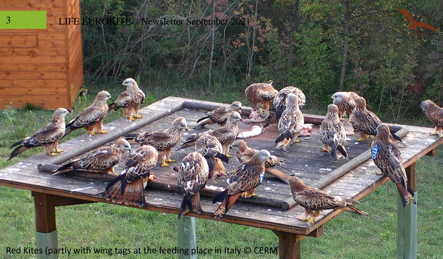
Red Kites (partly with wing tags) at the feeding place in Italy