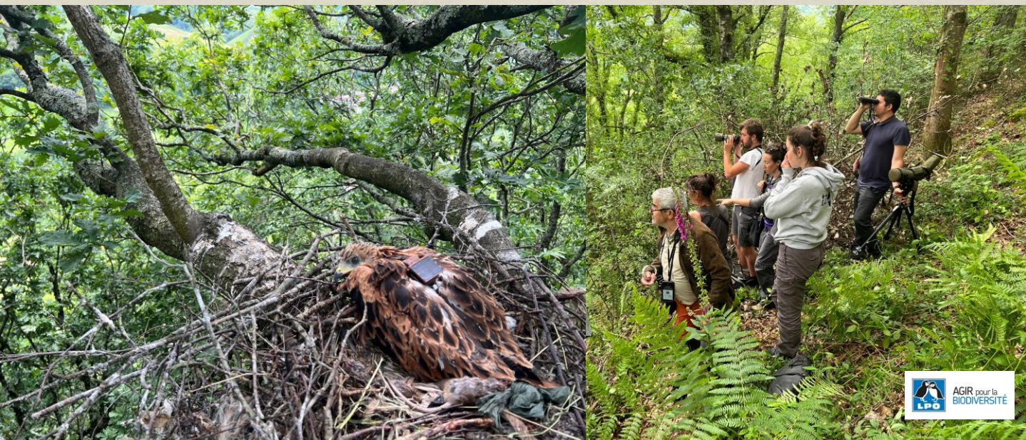
Left: Red kite with transmitter in France 2023, Right: Tagging team 2023 in France.

Endemic to Europe, the red kite is a diurnal bird of prey living in agricultural areas where livestock farming and mixed farming are combined. It can be recognized in flight by its light plumage and notched tail and can be seen throughout the year in France. Poisoning, shooting, collisions, electrocution: the anthropogenic threats to raptor populations across Europe are diverse and fearsome. Considering the status of concern of the red kite in France, a new National Action Plan (NAP), coordinated by the DREAL Grand Est and implemented by the LPO, was launched in 2018 for 10 years. The data collected within the LIFE EUROKITE project will complement and guide the conservation action of this NAP.