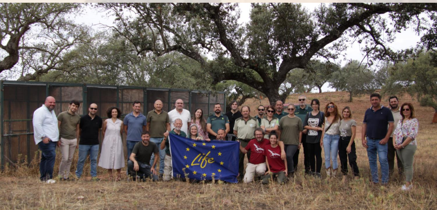
Representation of the entities that participate in the LIFE Eurokite in the context of the community of Extremadura during the introduction of the birds in the acclimatization facilities.

The arrival of this first group of red kites has been presided over by representatives of the Ministry for Ecological Transition, the General Directorate of Sustainability of the Junta de Extremadura and the mayor of Valencia del Mombuey, with representatives of other institutions such as the Civil Guard, Natural Environment Agents of the Junta de Extremadura, Birding in Extremadura and we especially highlight the participation of the entities that support this action within the LIFE EUROKITE project, such as ENDESA, Fundación Banco de Santander, Mossy Earth and the Badajoz Provincial Council and this year with the support of Iberia airlines.