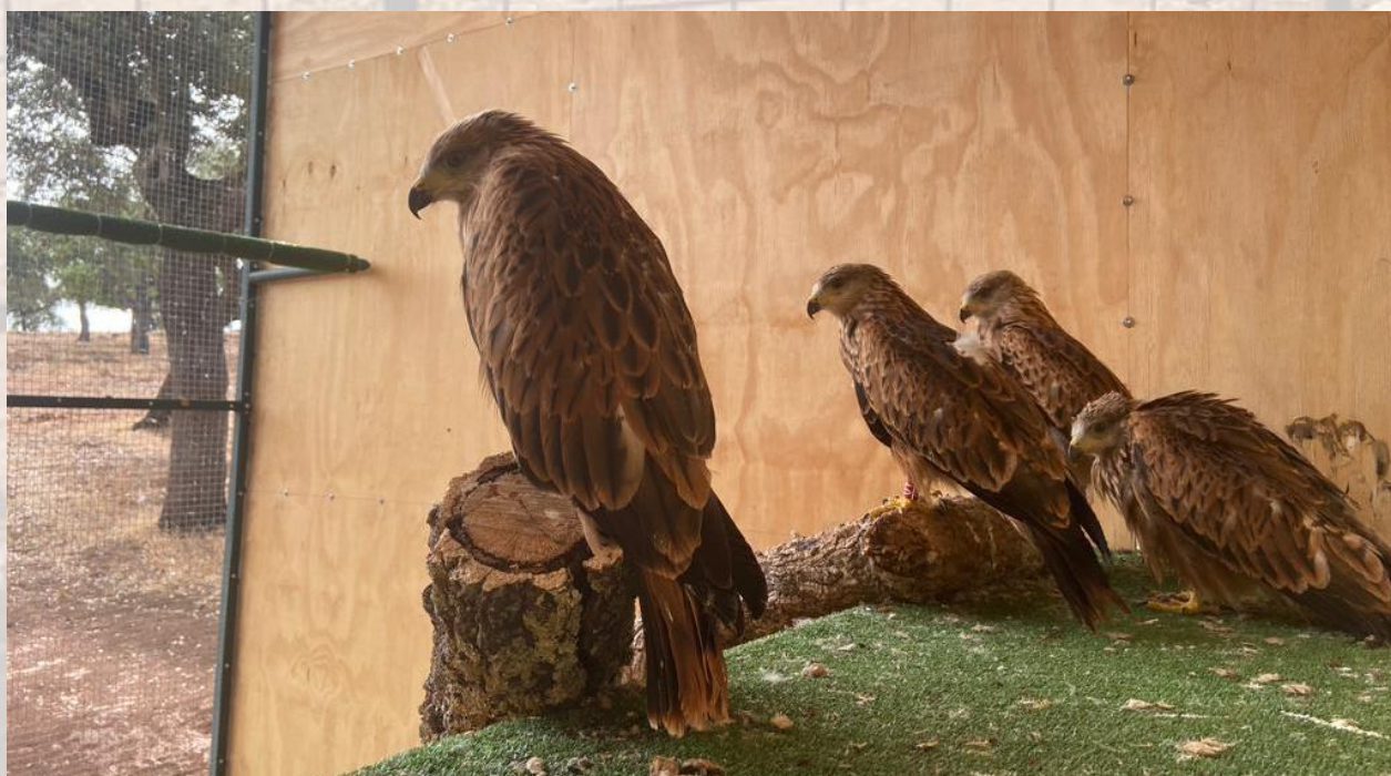
First group of red kites which were released in 2022.

This release has been being prepared for the first years during the LIFE EUROKITE project. A feasibility study has been carried out on an area of more than 600,000 ha between the provinces of Badajoz and Huelva. This study has revealed the suitability of the area for this population reinforcement action and has been reviewed and approved by a committee of 12 experts in conservation and reintroduction of the red kite from Spain, the United Kingdom and Italy.