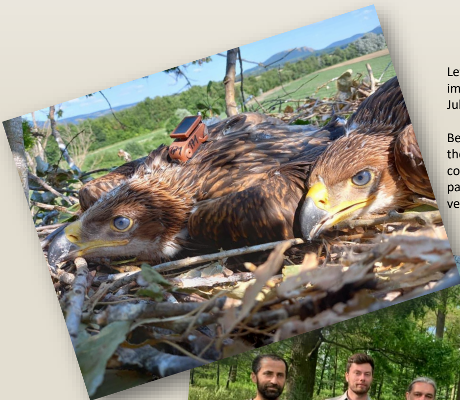
Left: The two tagged imperial eagles in Austria in July 2021.