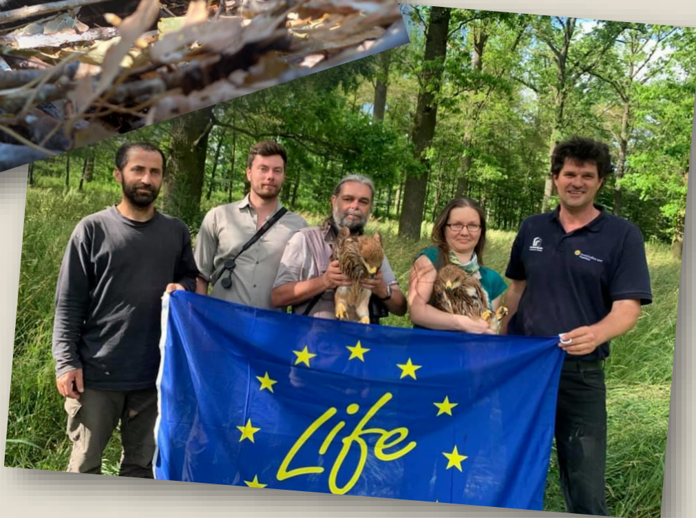
Below: The tagging team of the LIFE EUROKITE project in cooperation with the Czech partner CSO and the veterinarian university Brno.