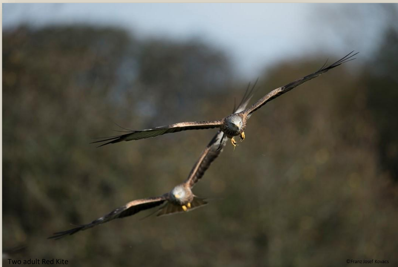
Two adult Red Kite

With the help of the telemetry data, the habitat use of the target species is to be determined and the main reasons for the mortality of birds of prey in the EU are to be quantified. Measures are to be taken to combat the main human-made causes of death, such as illegal persecution, particularly through poisoning, collisions with road and rail traffic, wind farms, as well as power lines and electricity pylons. It is therefore also intended to contribute to the implementation of a number of important EU policy objectives.