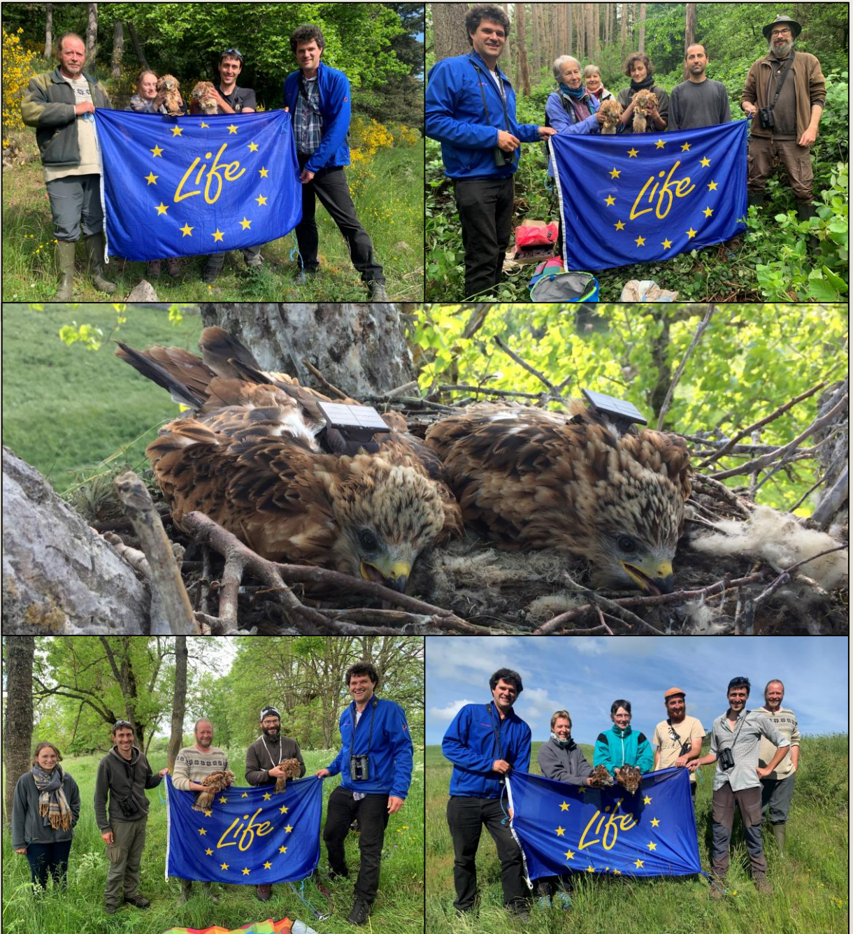
The tagging team of the LIFE EUROKITE project in cooperation with the French partner LPO.

At the beginning of June, a total of 26 young red kites were tagged in the course of the LIFE EUROKITE project together with our partner LPO (Ligue pour la Protection des Oiseaux) and the volunteers in France. We hope that the young red kites will have a long life ahead and that the GPS data will help to a better protection of the red kite and other raptors.